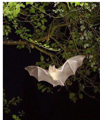
Greater Horseshoe Bat

The commonest bat recorded was, unsurprisingly, the common pipistrelle which is one of the commonest British bats. These amazing creatures weigh between 3 and 8 grams with a wingspan of 200 to 235 mm and eat small flying insects which they can locate in total darkness by means of ultrasonic echo location with a peak intensity at 45 kHz, a full octave above even a child's hearing. These are the bats often seen around dusk in our gardens.